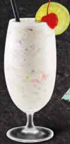
YAKULT PIPO JELLY $9

Passion fruit mojito is a mocktail consisting of refreshing citrus and mint flavours are intended to complement the potent kick of the passion fruit.