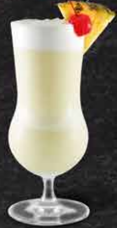
VIRGIN PINA COLADA $10

Its combination of yakult, refreshing citrus and topped with jelly fruit.