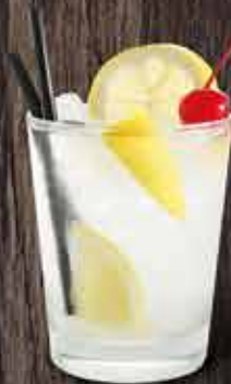
PEACH CAIPIROSKA $13 ★★★★★

The cappuccino martini is a cocktail made with vodka, kahula, black coffee and top with cream.