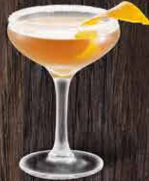
SIDECAR $14 ★★★★★

Tequila mixed with orange flavoured liqueur and lime juice often served with a salt rim.