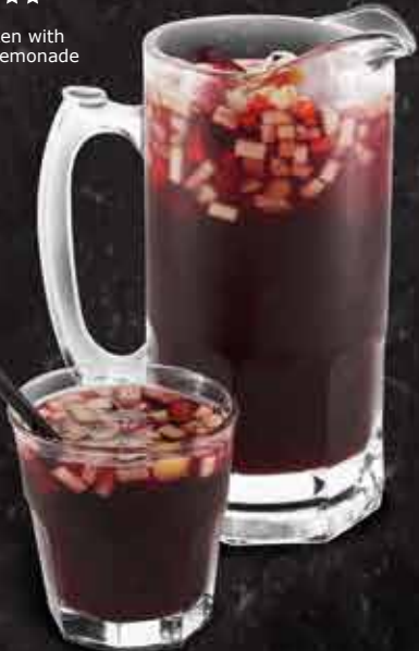
KINN SANGRIA (JUG $29) ★★★★★

House kaffir lime and lemongrass infused vodka, lightly shaken with lychee liqueur and apple.