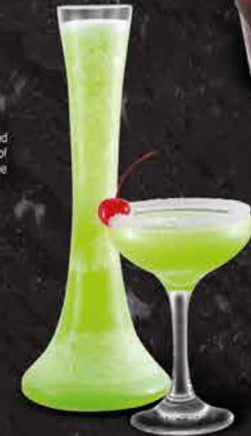
ANGEL SISTER $17 ★★★★★

Our house red wine, with seasonal fruit, raspberry liqueur, cinnamon and lemonade.