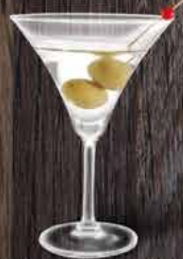
DRY MARTINI $12 ★★★★★

Fruity-infused rum, fresh lemon juice, a twist of citrus rind and a dash of home made sugar syrup.