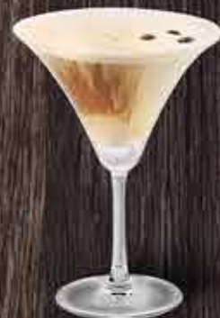
CAPPUCCINO MARTINI $14 ★★★★★

As the name suggests this cocktail originated in the city of Babylon in Long Island. A summer drink with a perfect mix of Vodka, Gin, Rum, Tequila, Cointreau with sour mix and a dash of coke.