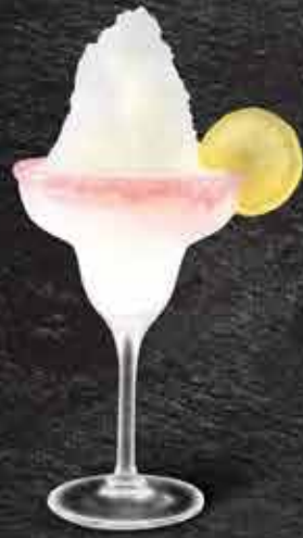
VIRGIN MARGARITA $9

Lemon juice, simple syrup, salt rim the glass and twist with lemon peel make this drink refresh energy