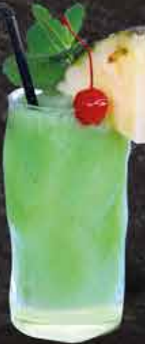
PINEAPPLE MINT LYCHEE $10

Plenty of lychee, touch of apple and citrus.