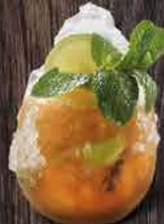
CAIPIRINHA $13 ★★★★★

The Old Fashioned is a cocktail made by sugar with bitters, then adding bourbon 101 proof and a twist of citrus rind. It is traditionally served in a old fashioned glass.