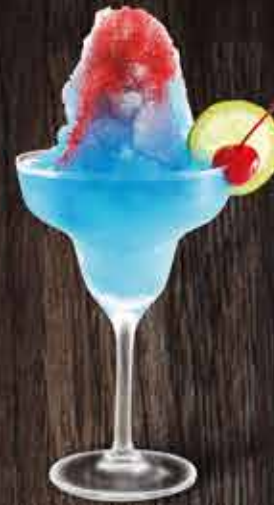
KAMIKAZE VOLCANO $14 ★★★★★

The martini is a cocktail made with gin and vermouth, and garnished with an olive and a lemon twist. Over the years, the martini has become one of the best-known mixed alcoholic beverages.