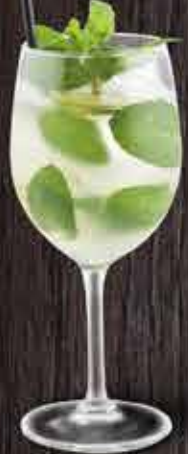
MOJITO $13 (JUG $29) ★★★★★

Kinn mojito is a cocktail consisting of refreshing citrus and mint flavors are intended to complement the potent kick of the rum.