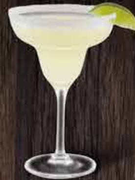
MARGARITA OR/ PASSION FRUIT $13 ★★★★★

Brazil's national cocktail, made with cachaca, brown sugar and lime.