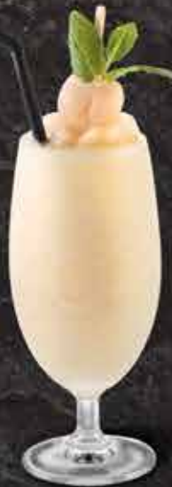
LYCHEE LYCHEE $9

Fresh watermelon blended with mint and hint of exotic fruit.