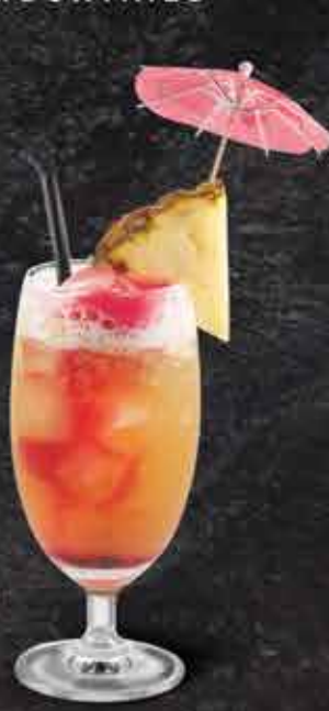
KOH SAMUI SUNRISE $9

Lemon juice, simple syrup, salt rim the glass and twist with lemon peel make this drink refresh energy