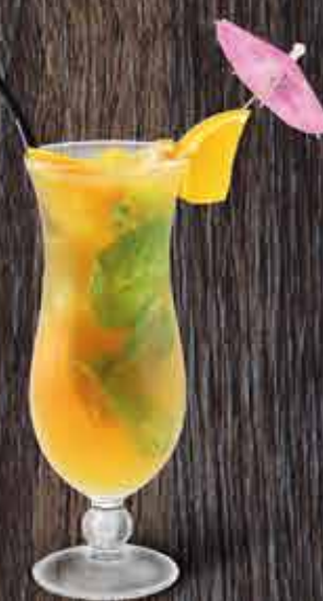
PIMMS NO.1 $14 (JUG $30) ★★★★★

A generous mix of vodka, peach schnapps and both orange and cranberry juice. Top with blue cognac liqueur of Kinn Thai style.