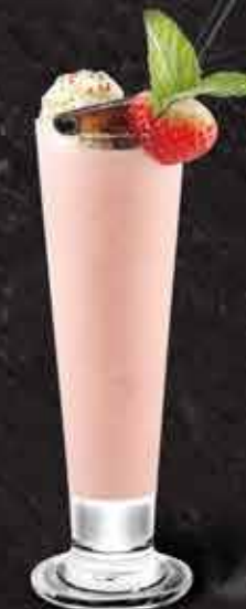
SUGAR DADDY $16 (JUG $34) ★★★★★

A refreshing mix of vodka and apple liqueur. Lengthened with freshly squeezed lime juice and sugar syrup. Please enjoy it.