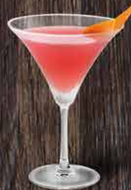
COSMOPOLITAN OR/ RASPBERRY $13 ★★★★★

A delicious drink for Kamikaze Volcano made with vodka, blue curacao, raspberry syrup and top with grenadine syrup.