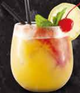
1984 $15 ★★★★★

Vodka, strawberry and lime juice mixed with a small dose of chambord. This cocktail adds a little extra to every ladies style.