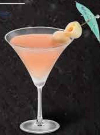
KINN MARTINI $16 ★★★★★

Malibu, bacardi, midori shaken with pineapple juice & topped with lemonade