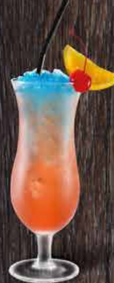
SEX ON THE BEACH $14 ★★★★★

Add vodka, fresh lime juice into a glass with ice. Top with ginger beer.