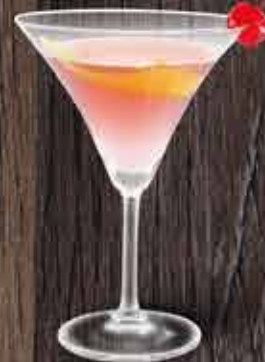
DAIQUIRI $13 ★★★★★

In cocktail shaker, combine cognac, cointreau, and lemon juice. Add ice and shake vigorously until well chilled. Strain into the glass and served with salt & sugar rim.