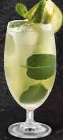
LEMONGRASS SMASH $10

Pineapple juice, passion fruit, touch of citrus and dash of grenadine.