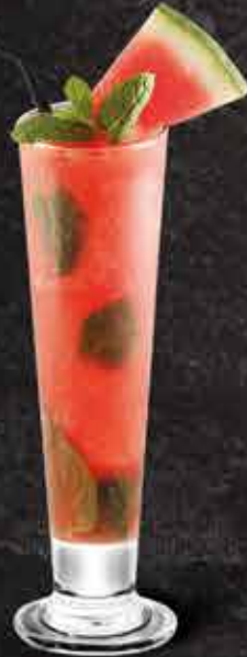
SWEET VALENTINE'S $10

Combination with tropical fruits, dash of grenadine syrup and hint of Thai style flowers.