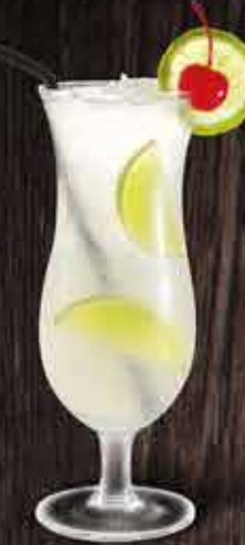
MOSCOW MULE $13 ★★★★★

A cosmopolitan is a cocktail made with premium vodka, cointreau, cranberry juice and freshly squeezed lime juice.