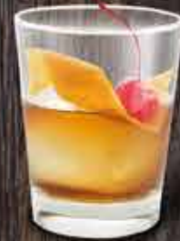
OLD FASHIONED $13 ★★★★★

The Spritz is a popular ritual. It is undoubtedly the most widespread and commonly drunk aperitif in Italy: a traditional ice-breaker and symbol of a lively atmosphere.