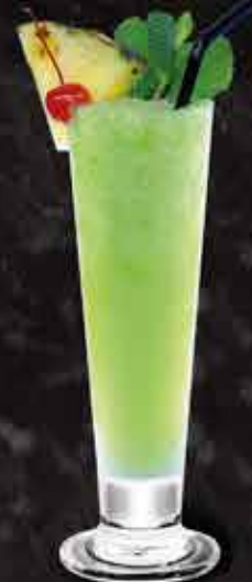
PINEAPPLE MINT LYCHEE DAIQUIRI $16 (JUG $31) ★★★★★

Wild strawberries, bailey's, strawberry liqueur and finish with cinnamon.