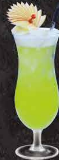
BABY GIRL $14 (JUG $26) ★★★★★

This cocktail is mixed from almond flavoured liqueur mixed with fresh lemon juice, dash of sugar syrup, egg white and shaken until the perfect consistency. Top with red wine.