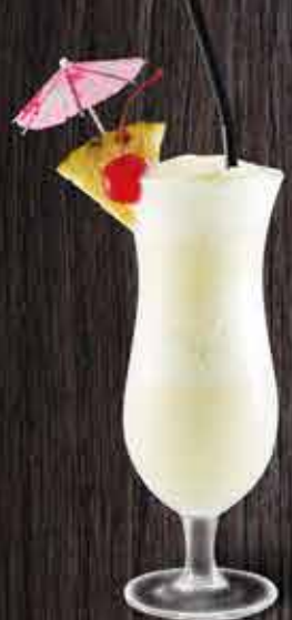
MAI TAI $14 (JUG $30) ★★★★★

Fresh lime, passion fruit, lychee, cane sugar and vodka