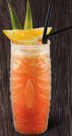
PASSION FRUIT CAPRIOSKA $14 ★★★★★

Kinn mojito is a cocktail consisting of refreshing citrus and mint flavors are intended to complement the potent kick of the rum.