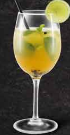
PASSION FRUIT MOJITO $9

Fresh lemongrass, mint, fresh lime smashed and topped with soda.