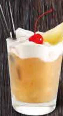
WHISKY SOUR $14 ★★★★★

Borebay Sapphire Gin, pimms, fresh mint, orange wedges and lashing of ginger beer.