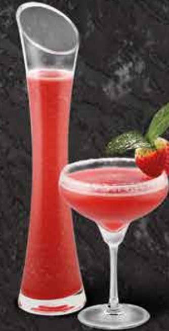
RED ANGEL $16 ★★★★★

Vodka, strawberry and lime juice mixed with a small dose of chambord. This cocktail adds a little extra to every ladies style.