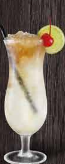
LONG ISLAND ICED TEA $15 (JUG $32) ★★★★★

Light rum, pineapple juice and coconut cream.