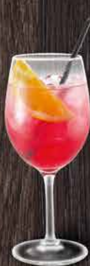
APEROL SPRITZ $13 ★★★★★

The mai tai is a rum based cocktail mixed with orange liqueur, tropical fruits juice and lime juice.